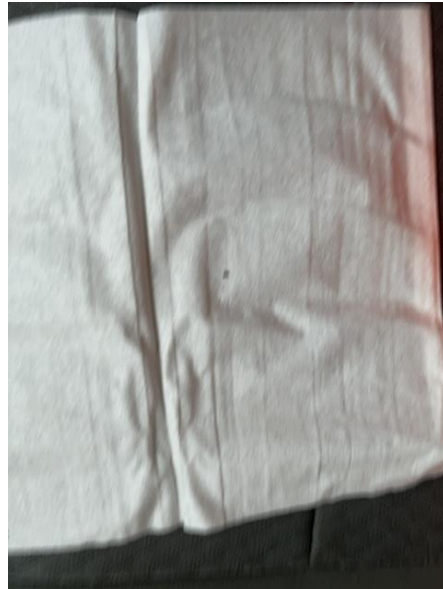
50 Flamborough way