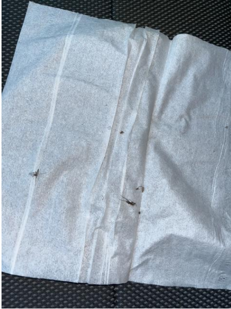
Mattawa Park (OUT)