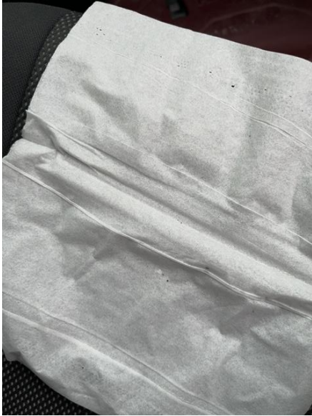
35 Akrose St.