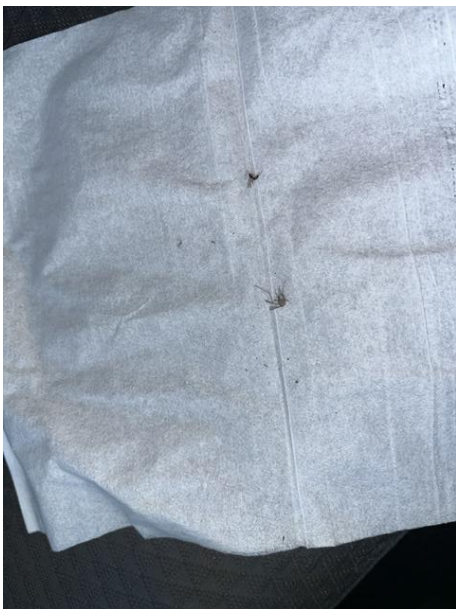
Mattawa Park (OUT)