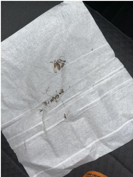
Mattawa Park (OUT)