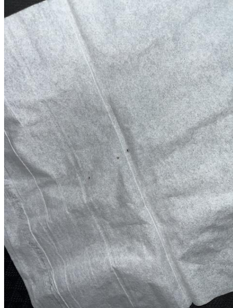
50 Flamborough way