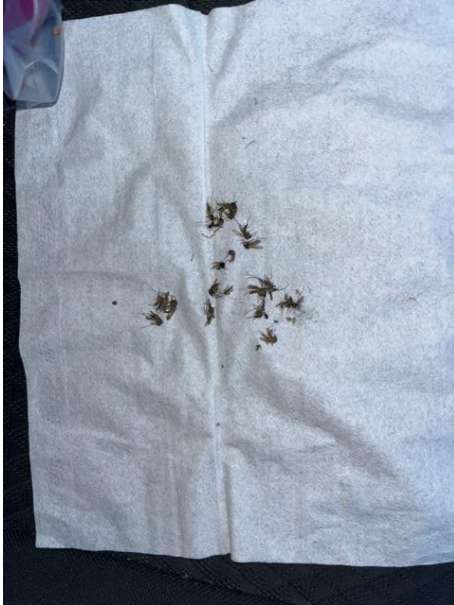
Mattawa Park (OUT)