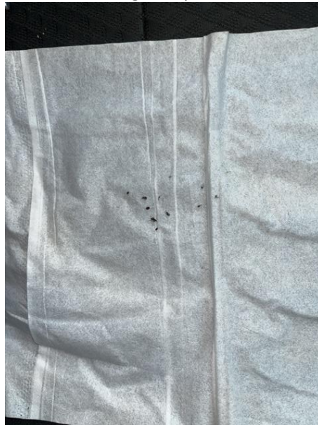
50 Flamborough way