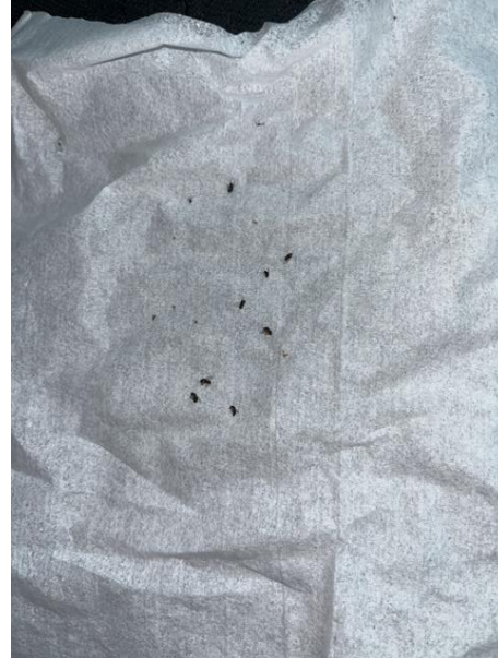
50 Flamborough way