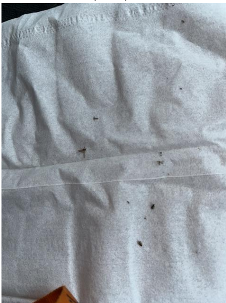
Mattawa Park (OUT)