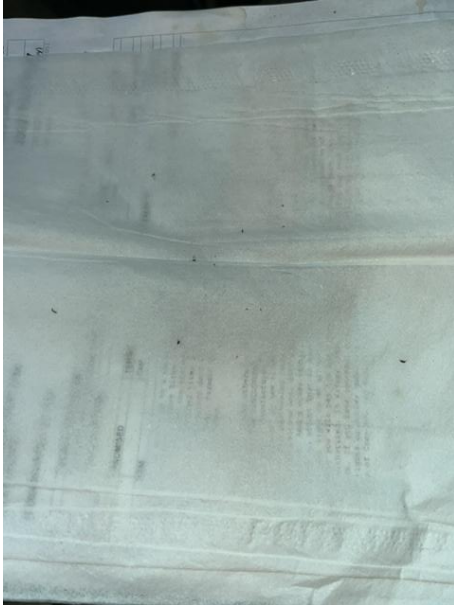
35, Akrose St.