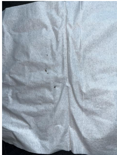
50 Flamborough way