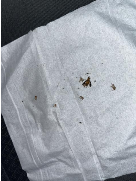
Mattawa Park (OUT)