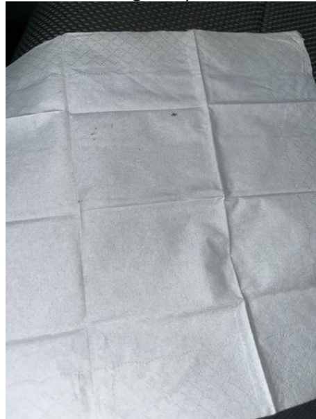
50 Flamborough way