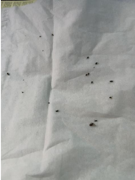
35, Akrose St.