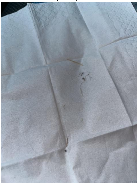
Mattawa Park (OUT)