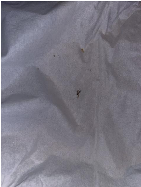
Mattawa Park (OUT)