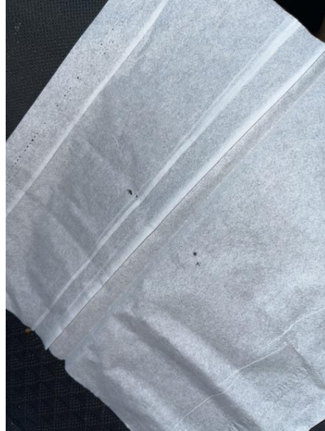
50 Flamborough way