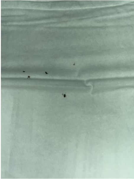
35, Akrose St.