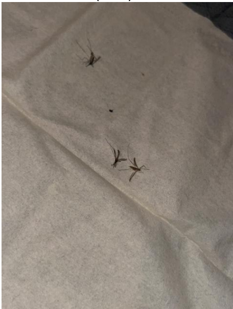
Mattawa Park (OUT)