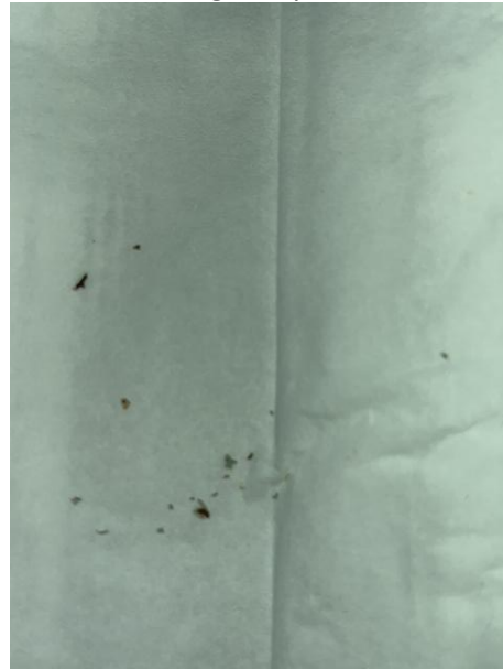
50 Flamborough way