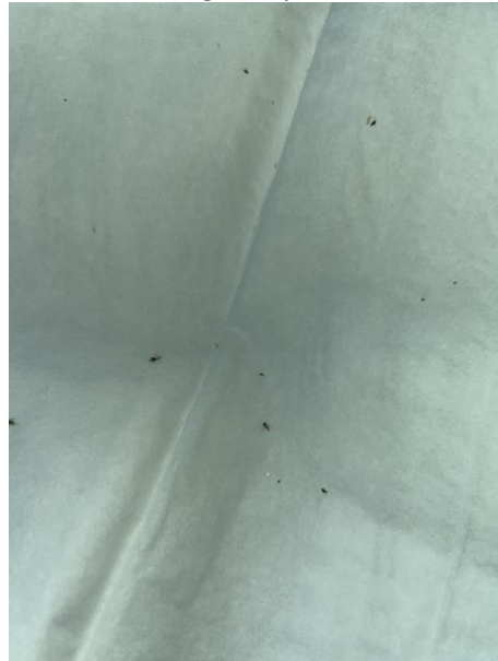
50 Flamborough way