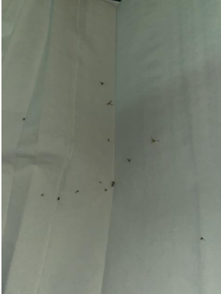
35, Akrose St.