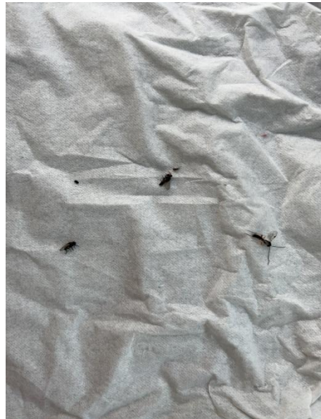
50 Flamborough Way