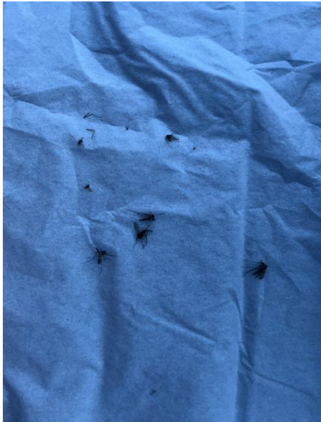
Mattawa Park (OUT)