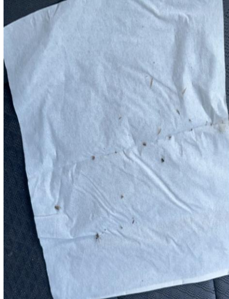
50 Flamborough Way