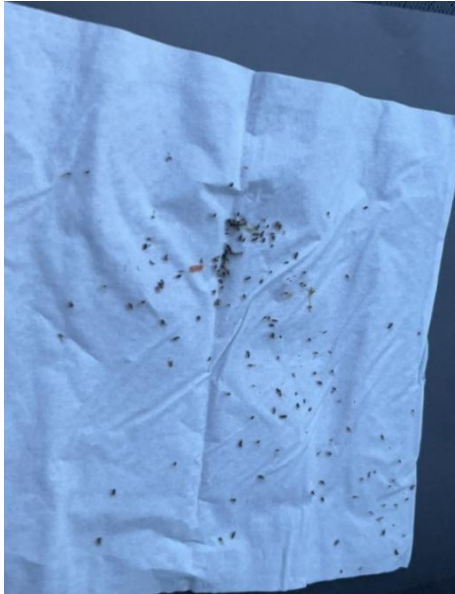
Mattawa Park (OUT)